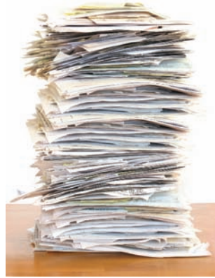
Checks, invoices, forms, and envelopes to be imaged

It's never been this easy to manage all of your documents. Utilize the Adaptive to image items. Then a combination of our comprehensive image processing tools along with industry leading third party full page recognition software allows you to present information to your application in a consolidated format that will help you save time and money.